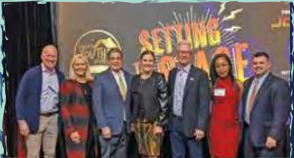
SETTING THE STAGE: RAISED $341,554