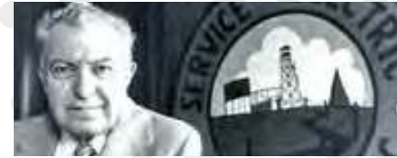
The invention of cable TV brought local sports, news and events to subscribers