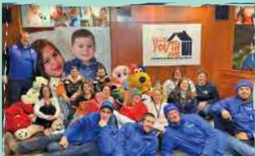
TEDDY BEAR TOSS: 8,480 teddy bears donated by the PPL Center and LV Phantoms