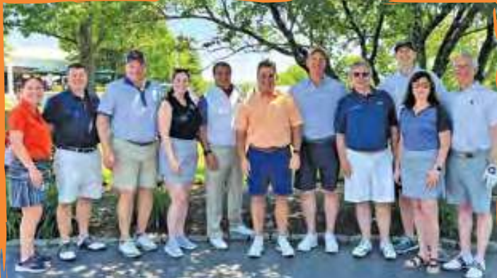
John E. Watson, Jr. Memorial Golf & Pickleball Tournament: RAISED $357,549