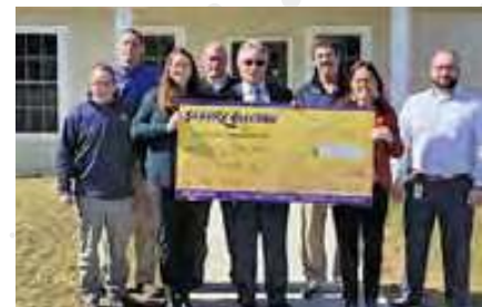
Last year, SECTV donated $50,000 to the Camp Fowler Cabin Campaign, enabling high-speed wireless internet across the camp.