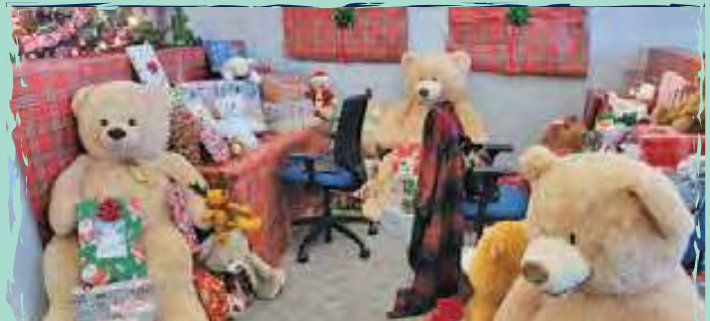
HOLIDAY GIFT DRIVE: RAISED $41,555 to provide hundreds of youth with a happy holiday