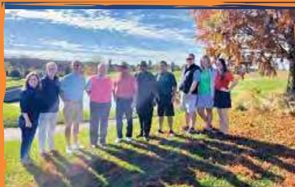
Annual Southeast Golf Tournament RAISED: $321,105