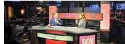
VYH is grateful for the countless media coverage opportunities Service Electric has provided to help spread awareness about our impactful mission.