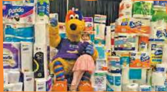
AIR PRODUCTS NIGHT: 4,430 rolls of toilet paper donated by the LV Phantoms